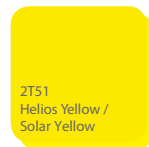
2T51 Helios Yellow / Solar Yellow