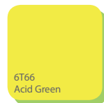
6T66 Acid Green