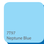
7T97 Neptune Blue