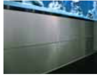
< AliFrost® Door 55 Slimline with Platinum 9PY2 (see page 20)

Perspex® Pearlescent is a single sided product that uses light and shade to great effect as the light is reflected from the surface at different angles meaning that virtually every POS display crafted from Perspex® Pearlescent could be considered unique!