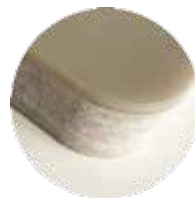
Perspex® & Echopanel®