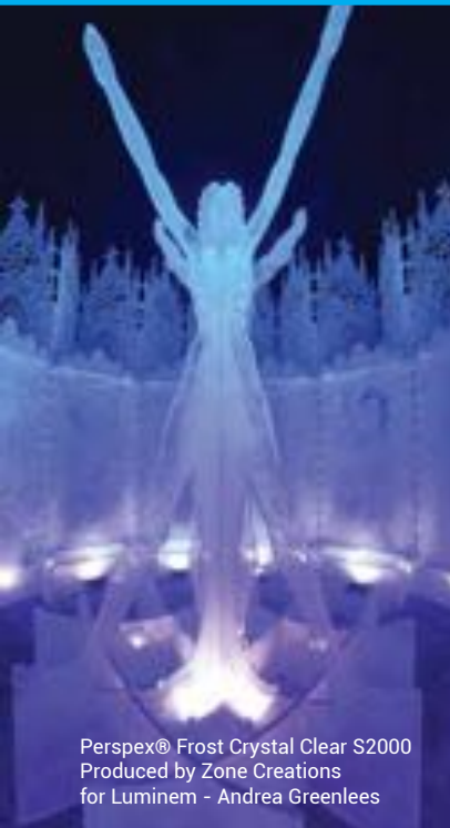
Perspex® Frost Crystal Clear S2000 Produced by Zone Creations for Luminem - Andrea Greenlees

*Please note not all of these attributes apply to all products and or brands. Please check individual product specifications and guarantees before purchasing.