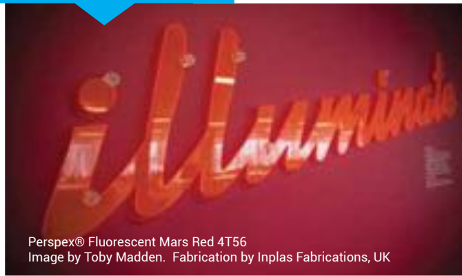
Perspex® Fluorescent Mars Red 4T56 Fabrication by Inplas Fabrications, UK