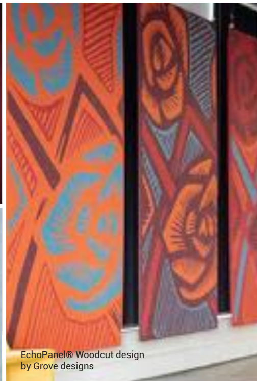
EchoPanel® Woodcut design by Grove designs