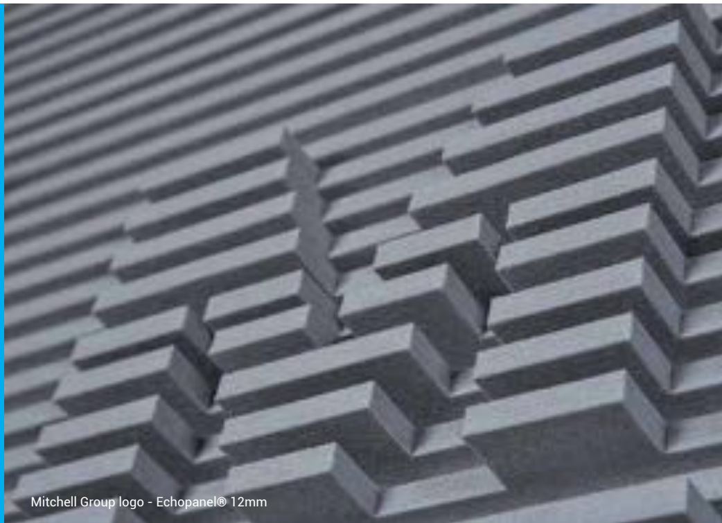
Mitchell Group logo - Echopanel® 12mm

As a 3rd generation family owned and run business for over 71 years, Mitchell Group Australia has built a reputation within the building industry for treating its' customers like family. Our family includes talented designers, machine operators and production engineers with years of experience in delivering concepts within tight deadlines.