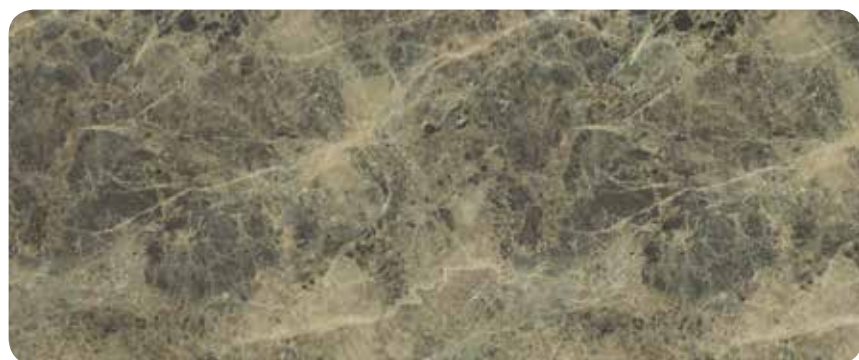
Breccia Paradiso* DiamondGloss finish