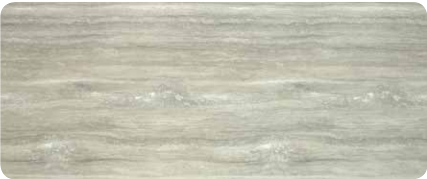
Silver Travertine* Matt finish