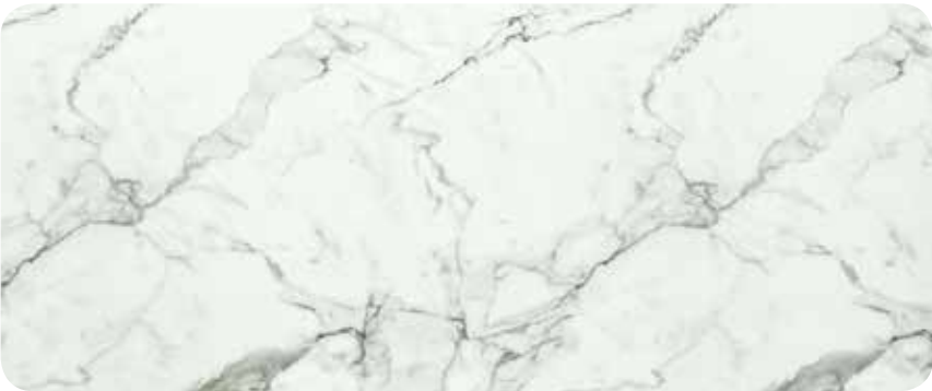
Carrera Marble* Matt finish