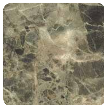
Breccia Paradiso# DiamondGloss finish