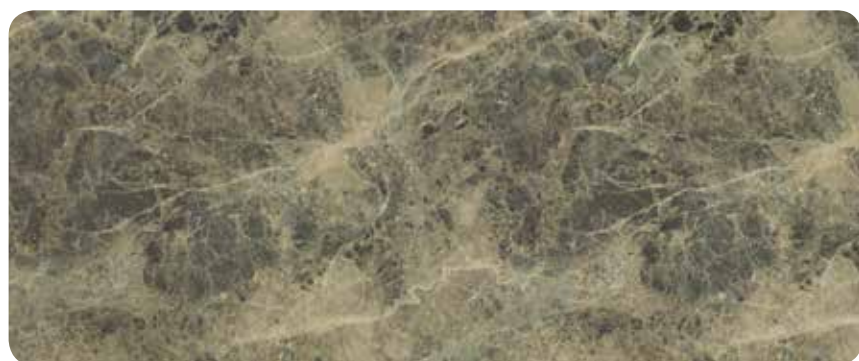
Breccia Paradiso* Matt finish