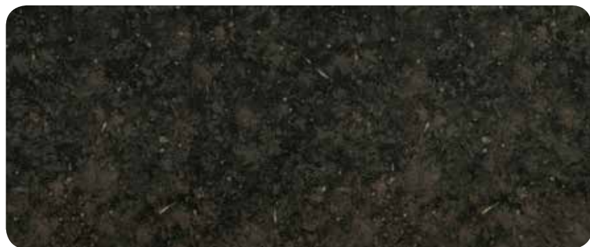
Black Fossilstone* DiamondGloss finish