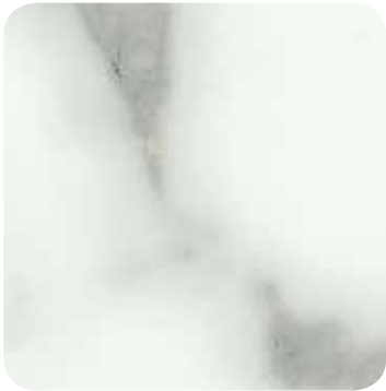
Carrera Marble# DiamondGloss finish