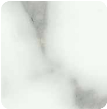
Carrera Marble# Matt finish