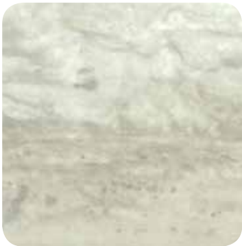
Silver Travertine# Matt finish