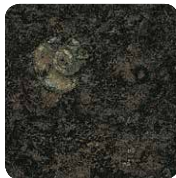
Black Fossilstone# DiamondGloss finish