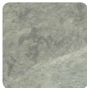
Soapstone Sequoia* DiamondGloss finish