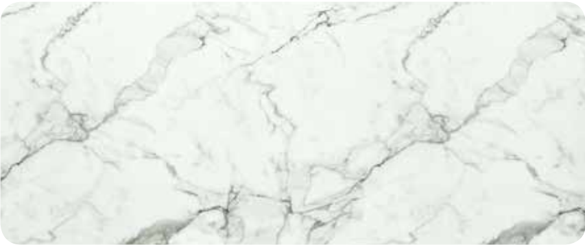
Carrera Marble* DiamondGloss finish