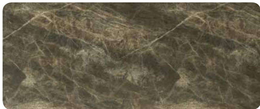
Slate Sequoia* DiamondGloss finish