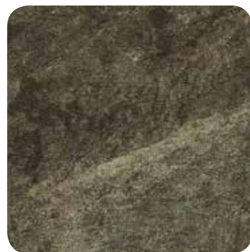
Slate Sequoia* DiamondGloss finish