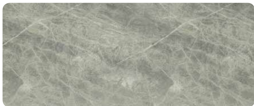
Soapstone Sequoia* DiamondGloss finish