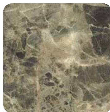
Breccia Paradiso# Matt finish