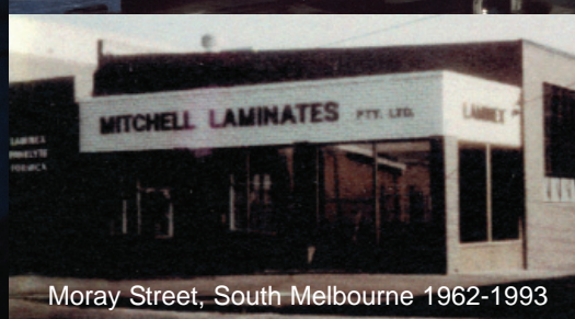
Moray Street, South Melbourne 1962-1993