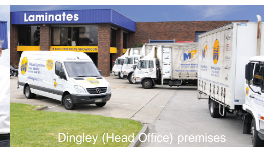
Dingley (Head Office) premises