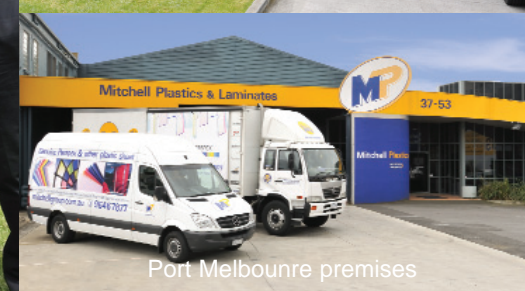
Port Melbourne premises