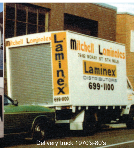
Delivery truck 1970's-80's