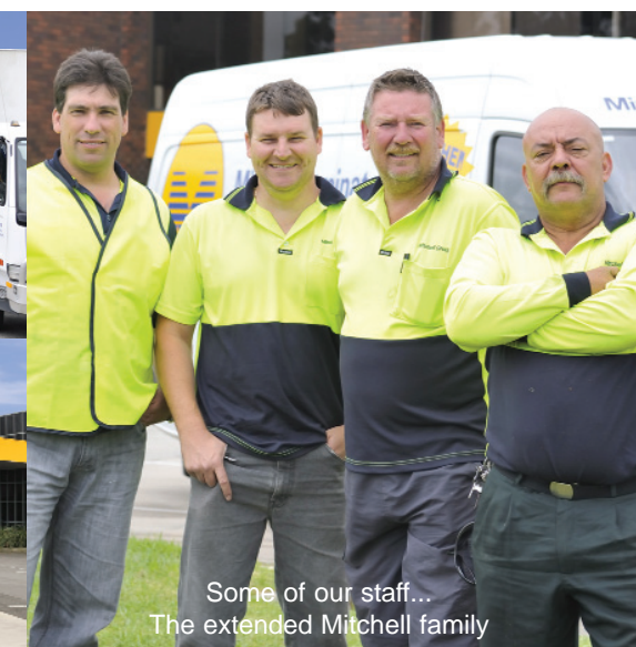
Some of our staff... The extended Mitchell family