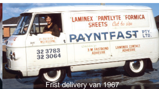
First delivery van 1967